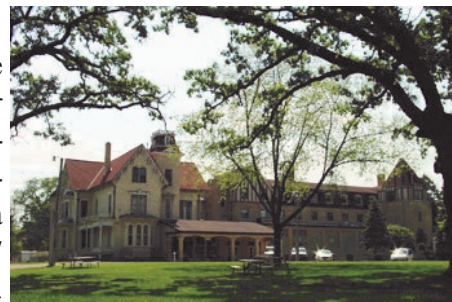
Lakeside Legacy Arts Park