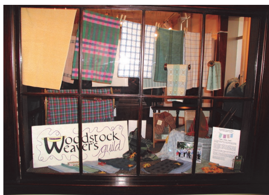
The 2008 Fiber Arts Show

Our hand-wovens range from household linens, to rugs and draperies, to "art to wear" clothing. We encourage the development of artistic and technical skills in hand-weaving, and promote public knowledge and appreciation of hand-weaving as both a craft and as an art with tangible market value. We also provide artist/weavers opportunities to explore the historical development of hand-weaving as well as the many forms and techniques of hand-weaving employed throughout the world as well as providing opportunities for the general public to view the work of local, national and international hand-weavers.